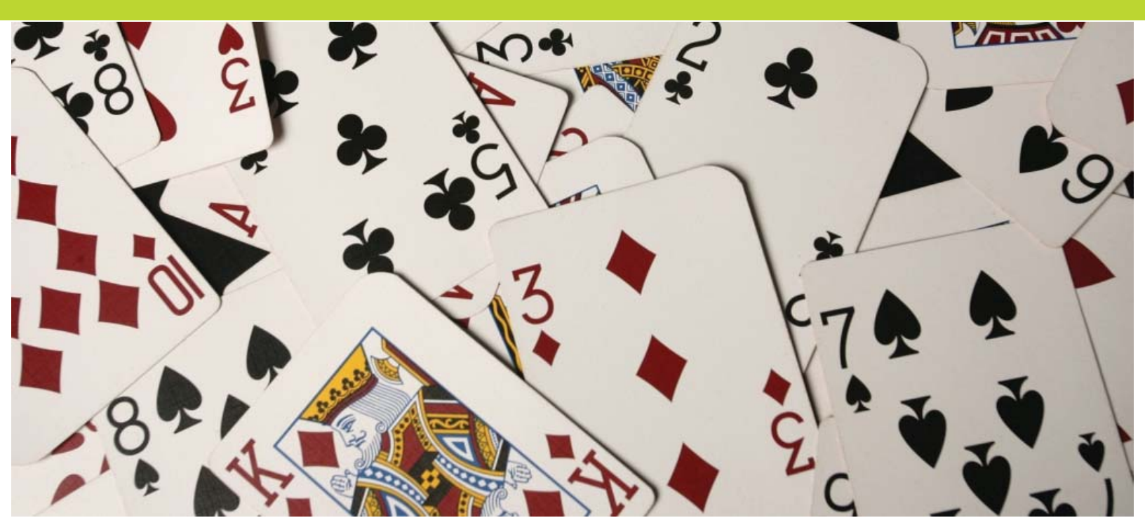
»»» Continued from page 2