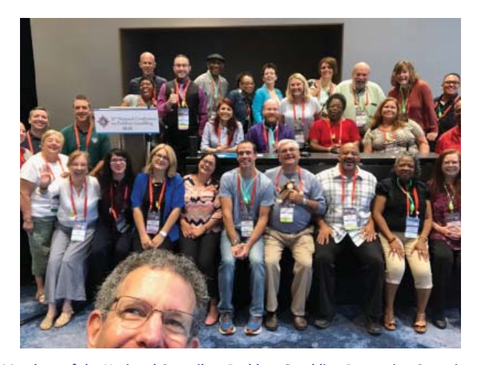
Members of the National Council on Problem Gambling Prevention Committee at the National Conference on Problem Gambling in 2018. The Committee represents a core group of individuals who plan, promote, implement, and advocate for problem gambling prevention and awareness services in the U.S. and Canada. Visit: www.ncpgprevention.org

While youth gambling is seen by parents as not as harmful of an issue and a low priority to address compared with many other behaviors (Campbell, Derevensky, Meerkamper & Cutajar, 2011), concerns about youth video gaming are inarguably on the rise and the 2019 official classification of video gaming disorder in the 11th edition of the International Classification of Diseases (ICD-11, World Health Organization) gives additional credence to the need to address video gaming. There is much to be gained in leveraging public interest in problematic video gaming with youth problem gambling prevention efforts. Initiatives such as those developed in Ohio (https://changethegameohio.org/), Oregon (www.preventionlane.org/gaming), and Ontario, Canada (https://learn.problemgambling. ca/) use available data to develop material aligned with evidence-informed problem gambling prevention practices.