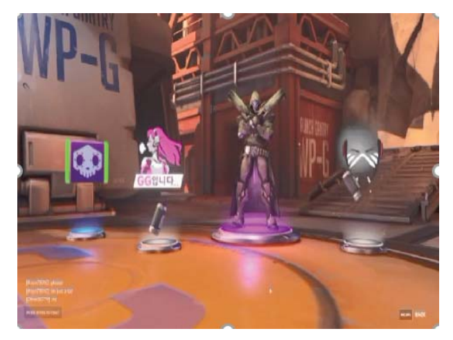
Loot box opening in Overwatch video game